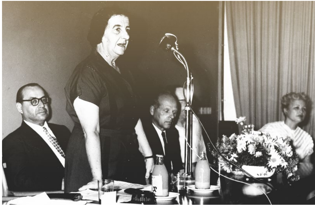
1957, Prime Minister Golda Meir received a financial prize from the Jewish Congress as the woman who contributed the most for the Jewish people. In the picture: Meir is declaring that she will donate the funds for AICF scholarships