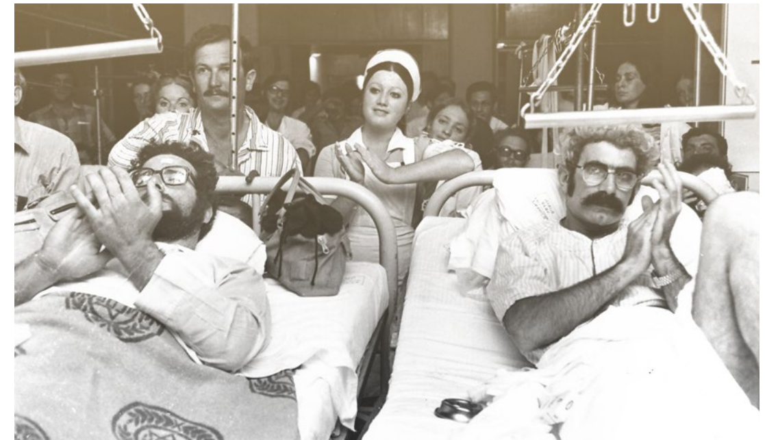
Injured soldiers from the Kippur war applauding to a performance by AICF artists.