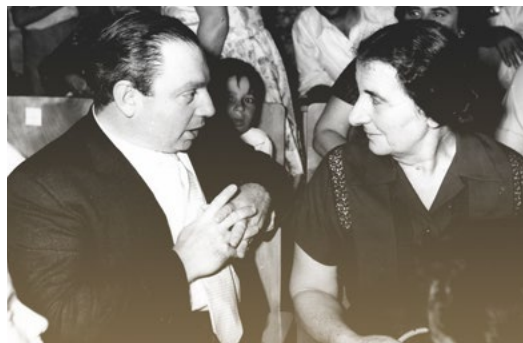
1988, Isaac Stern and Prime Minister Golda Meir

A letter from the President of the United States Lyndon B. Johnson addressed to Isaac Stern.