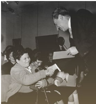
1956, Itzhak Perlman receives AICF scholarship