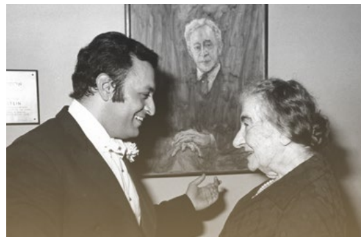
1977, Prime minister Golda Meir and Zubin Mehta in IPO concert