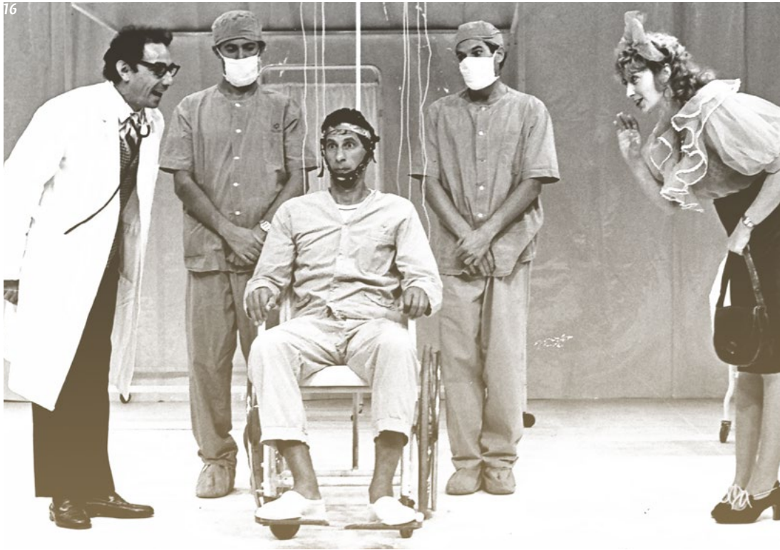
1986, Young Artists week